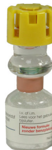
Figure 5 Injectable hydrocortisone.