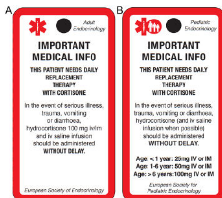
Figure 4 Emergency Keycard (54 × 28.5 mm); (A) adult edition, (B) paediatric edition.

that the patient should not hesitate to use emergency injections or contact a physician. If necessary, this information has to be repeated over and over again. In addition, it also appears to be important to inform some doctors that a well-educated and well instructed patient will not misuse the emergency injection. Thus, continued efforts are needed to provide easily accessible and correct information to enhance awareness of AI and crisis management, for example, in social media and periodic courses to healthcare providers. We recommend that all patients with AI always carry the European Emergency Card. A well-known medical alert card increases the chances of the patient's medical